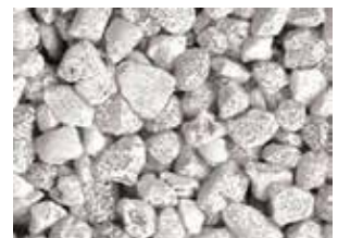
SD 9026 2-3