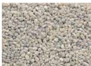
SC 9008 2-3