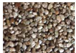
S 8010 2-3

Stocked color options are stocked up to 4,000 SF in Nevada.